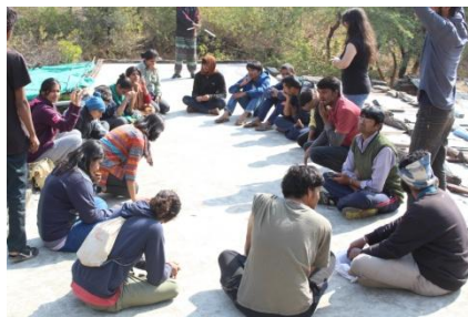
Khojis sharing at the meet closure

While reflecting during a team meeting before the meet, we made a list of purposes khojis come with when they join Swaraj and then assessed how much of it is met with the program we co-design with them. It was a good reflective exercise for us as it made us see the bigger picture and helped us chart out some action plan for the coming years. And we felt it would be a good opportunity to try some in this meet as an experiment.