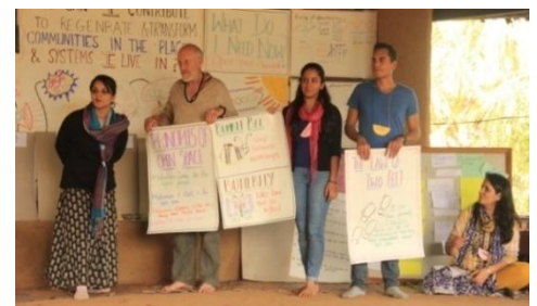
Participants sharing about 'Open Space Technology' during Art of Hosting workshop

'Learning Societies Un-conference' – a confluence of 500+ people from diverse background coming to co-create was held for a week in